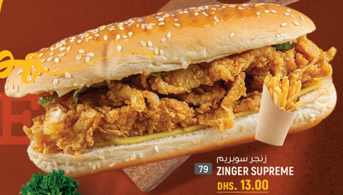
79 زنجير سوبرريم ZINGER SUPREME DHS. 13.00