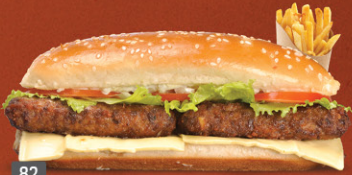
82 كومبو كباب KABAB COMBO DHS. 11.00