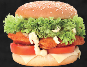
برجر فليليه دجاج 77 CHI. FILLET BURGER DHS. 11.00