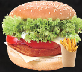
برجر دجاج 72 CHICKEN BURGER DHS. 9.00