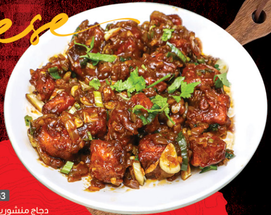
63 دجاج منشوريان CHICKEN MANCHURIAN DHS. 13.00