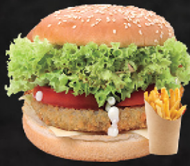
برجر خضار 73 VEG. BURGER DHS. 8.00