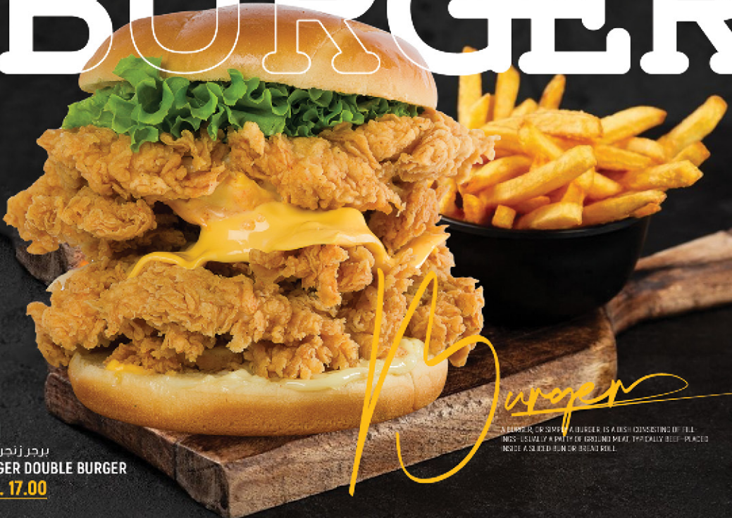
78 برجر زنجير دبل ZINGER DOUBLE BURGER DHS. 17.00

A BURGER IS OR SIMILAR A BURGER IS A DISH CONSISTING OF FILLINGS (USUALLY A PATTY OF GRILLING MEAT, TYPICALLY BEEF) PLACED INSIDE A SCHELD BUN OR BREAD ROLL.