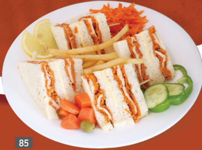
85 كلوب زنجير ZINGER CLUB DHS. 16.00