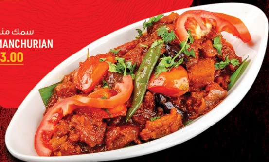
68 سمك منشوريان FISH MANCHURIAN DHS. 13.00