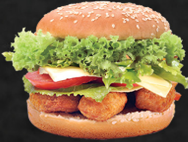
برجر جمبو روبيان 75 JUMBO PRAWNS BURGER DHS. 11.00