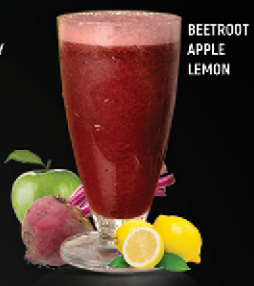
باي فايف 95 BY FIVE