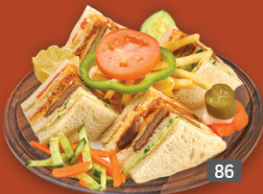
86 كلوب لحم بقر BEEF CLUB DHS. 15.00

A SANDWICH IS A DISH TYPICALLY CONSISTING OF VEGETABLES, SLICED CHEESE OR MEAT, PLACED ON OR BETWEEN SLICES OF BREAD, OR MORE GENERALLY ANY DISH WHEREIN BREAD SERVES AS A CONTAINER OR WRAPPER FOR ANOTHER FOOD TYPE.