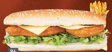
84 جمبو روبيان JUMBO PRAWNS DHS. 11.00