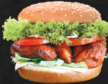
برجر دجاج تندوري 76 CHI. TANDOORI BURGER DHS. 11.00