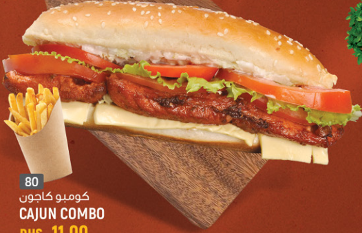
80 كومبو كاجون CAJUN COMBO DHS. 11.00