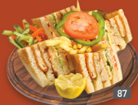
87 كلوب دجاج CHICKEN CLUB DHS. 13.00