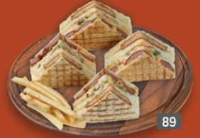
89 كلوب نقانق HOTDOG CLUB DHS. 13.00