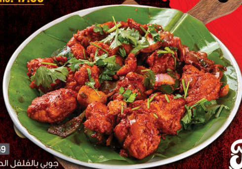
69 جوبي بالفلفل الحار CHILLI GOBI DHS. 12.00