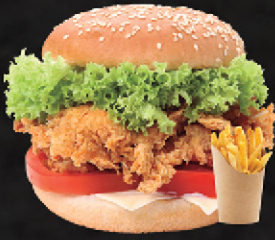
برجر زنجير 71 ZINGER BURGER DHS. 13.00