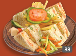
88 كلوب خضار VEGETABLE CLUB DHS. 12.00