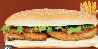
83 دجاج بالليمون CHICKEN LEMON DHS. 11.00