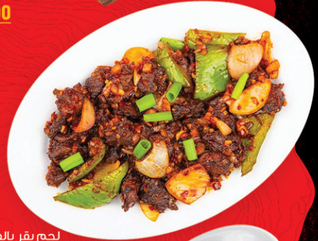
65 لحم بقر بالفلفل الحار BEEF CHILLI DHS. 13.00