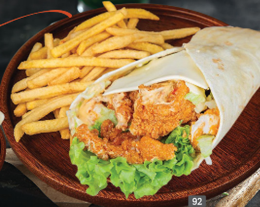
راب بيض EGG WRAP DHS. 11.00