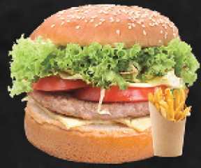
برجر لحم ضأن 74 MUTTON BURGER DHS. 11.00