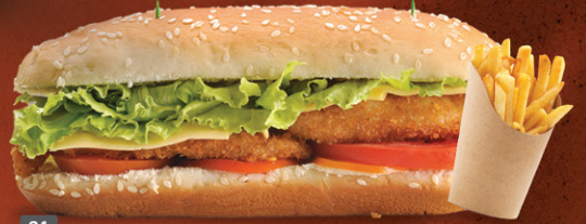
81 كومبو فيليه دجاج CHICKEN FILLET COMBO DHS. 11.00