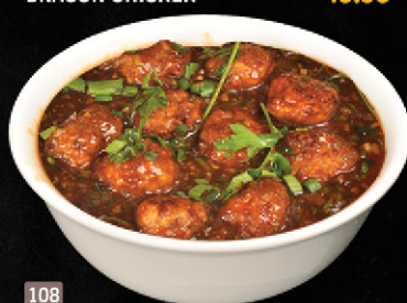
108 خضار منشوريان VEG. MANCHURIAN