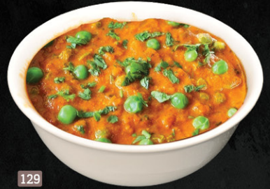
129 بازلاء خضراء مسالا GREEN PEAS MASALA DHS. 8.00