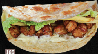
185 براتا تيككا TIKKA PORATTA DHS. 6/12