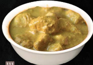
111 كورما دجاج CHICKEN KORMA