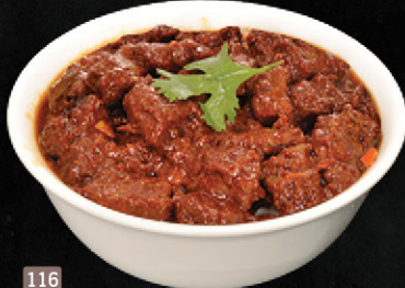
116 لحم بقر روست BEEF ROAST