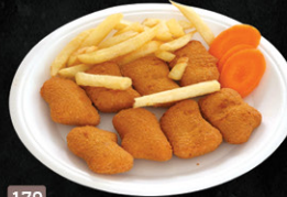
179 قطع دجاج CHICKEN NUGGETS DHS. 8/12