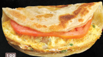
188 براتا اومليت OMELETTE PORATTA DHS. 4/8