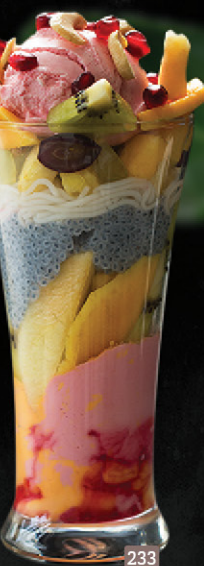
فالودة رويال ROYAL FALOODA DHS.15.00