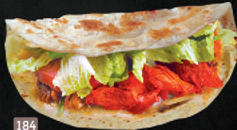
184 براتا دجاج بالهلفل الحار CHILLI PORATTA DHS. 6/12