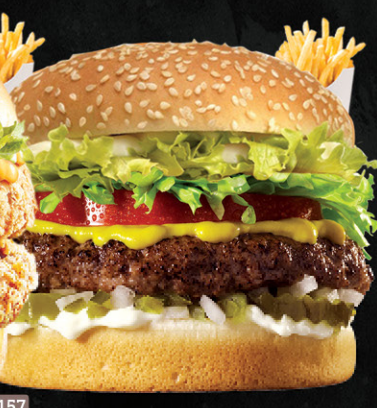
157 برجر مشوي GRILLED BURGER