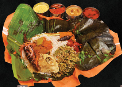
75 پوتی شورو POTHICHORU DHS. 13.00