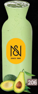
أفوكادو AVOCADO DHS. 7/10/13