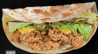
181 براتا مطافي MATHAFI PORATTA DHS. 12.00