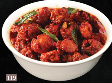
119 دجاج ٦٥ CHICKEN 65 DHS. 16.00