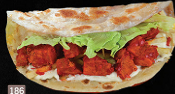
186 براتا لحم بقر BEEF PORATTA DHS. 6/12