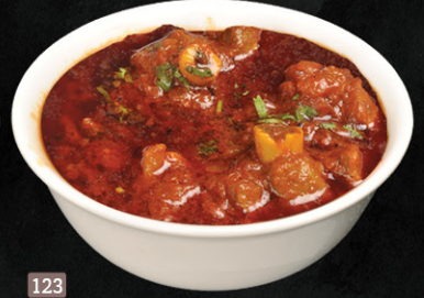
123 لحم ضأن مسالا MUTTON MASALA DHS. 16.00