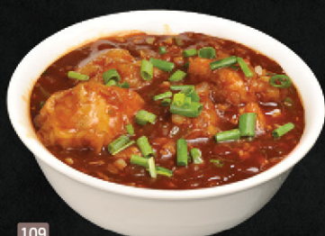
109 دجاج منشوريان CHICKEN MANCHURIAN