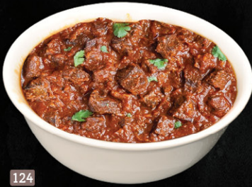
124 لحم بقر مسالا BEEF MASALA DHS. 13.00