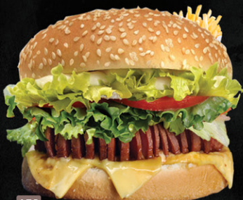
153 برجر تكا TIKKA BURGER