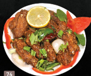
74 دجاج بالفلفل مر/جاف PEPPER CHICKEN DRY/GRAVY DHS. 16.00