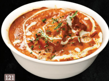
121 دجاج بالزبدة BUTTER CHICKEN DHS. 15.00