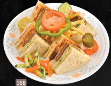
168 كلوب لحم بقر BEEF CLUB