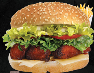
151 برجر فيليه دجاج CHI. FILLET BURGER