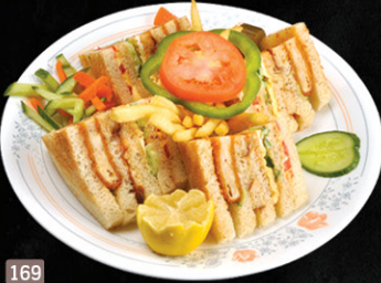
169 كلوب دجاج CHICKEN CLUB