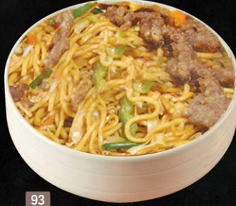
93 معكرونة لحم بقر BEEF NOODLES DHS. 15.00