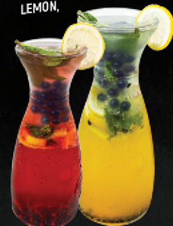
199 فراولة باشون فروت STRAWBERRY PASSION MOJITO DHS. 20.00