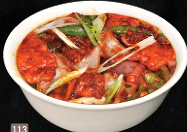
113 سمك باللفل الحار FISH CHILLI