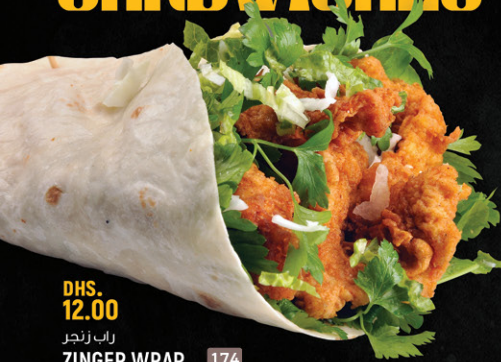
DHS. 12.00 راب زنجير ZINGER WRAP 174