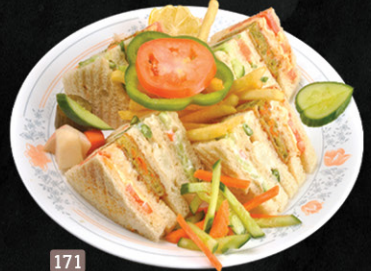
171 كلوب خضار VEGETABLE CLUB