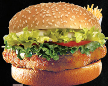
149 برجر خليج KHALEEJ BURGER