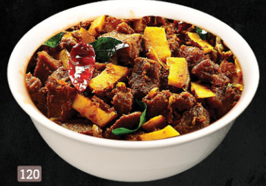
120 لحم بقر بالفلفل مقلي BEEF PEPPER FRY DHS. 15/16