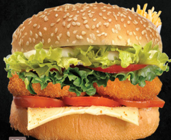
154 برجر قطع دجاج NUGGETS BURGER