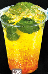
196 باشون فروت PASSION FRUIT DHS. 15.00