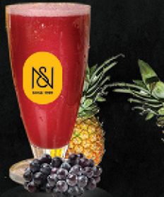
191 PURPLE PINE PINEAPPLE, BLACK GRAPE