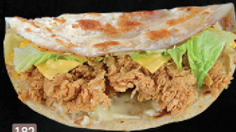
182 براتا زنجير ZINGER PORATTA DHS. 12.00