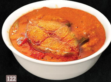
122 سمك مسالا FISH MASALA DHS. 13.00