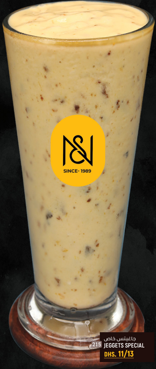
جاغيتس خاص JEGGETS SPECIAL DHS. 11/13