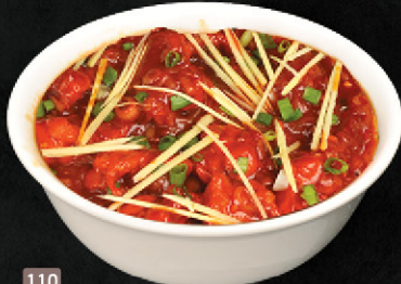
110 دجاج بالزنجبيل GINGER CHICKEN