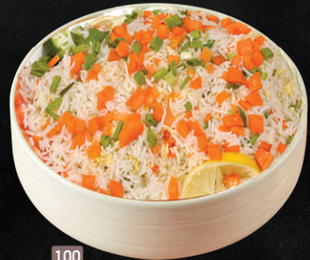
100 ارز مقلي خضار VEG. FRIED RICE DHS. 12.00