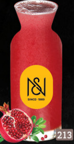
رمان POMEGRANATE DHS. 8/10/13