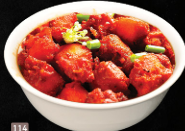
114 دجاج باللفل الحار مرقه/جاف CHI-CHILLI DRY/GRAVY