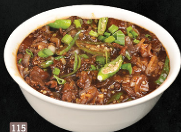
115 لحم بقر باللفل الحار BEEF CHILLI