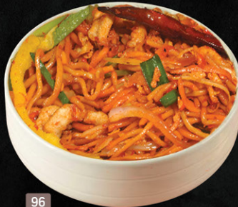
96 معكرونة سيشوان دجاج SCHEZWAN CHI. NOODLES DHS. 16.00