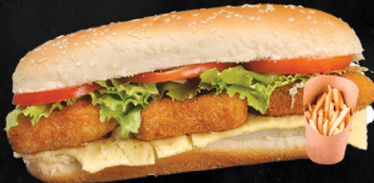
164 كومبو قطع دجاج NUGGETS COMBO