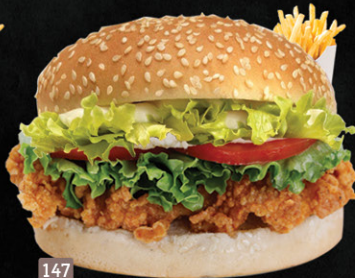
147 برجر زنجبر ZINGER BURGER