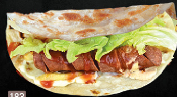
183 براتا هوت دوج HOTDOG PORATTA DHS. 10.00