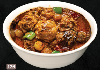
126 كداي دجاج CHICKEN KADAI DHS. 15.00