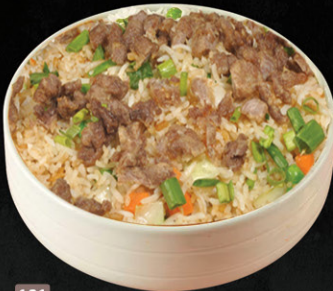
101 ارز مقلي لحم بقر BEEF FRIED RICE DHS. 14.00