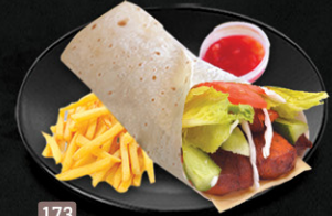
173 راب تكا TIKKA WRAP