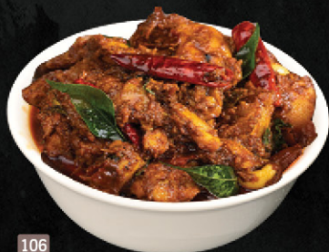
106 دجاج تشوكا CHICKEN CHUKKA