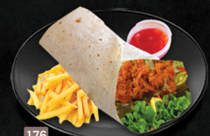
176 راب مطافي MATHAFI WRAP