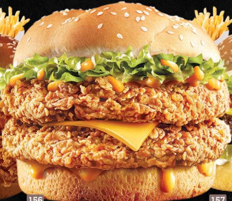
156 برجر ميغا زنجبر MEGA ZINGER BURGER