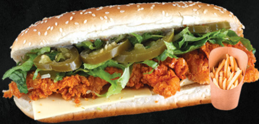
158 كومبو برق و رعد BARQ WA RAAD COMBO

A SANDWICH IS A DISH TYPICALLY CONSISTING OF VEGETABLES, SLICED CHEESE OR MEAT, PLACED ON OR BETWEEN SLICES OF BREAD, OR MORE GENERALLY ANY DISH WHEREIN BREAD SERVES AS A CONTAINER OR WRAPPER FOR ANOTHER FOOD TYPE. THE SANDWICH BEGAN AS A PORTABLE, CONVENIENT FINGER FOOD IN THE WESTERN WORLD, THOUGH OVER TIME IT HAS BECOME PREVALENT WORLDWIDE.