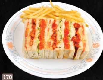
170 كلوب إمارات EMARAT CLUB