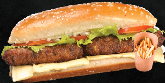
162 كومبو كباب KABAB COMBO