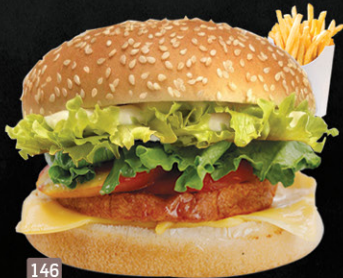
146 برجر دجاج/لحم بقر CHI./BEEF BURGER