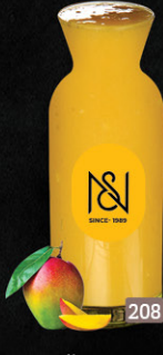
مانجو MANGO DHS. 7/10/13