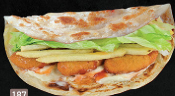
187 براتا خاص SPECIAL PORATTA DHS. 12.00