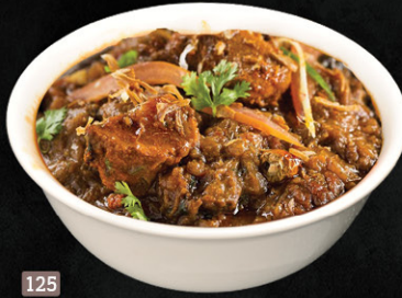
125 كداي لحم ضأن MUTTON KADAI DHS. 16.00