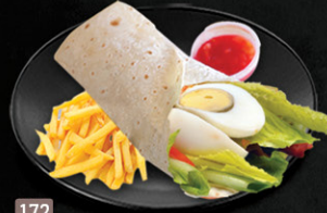
172 راب بيض EGG WRAP