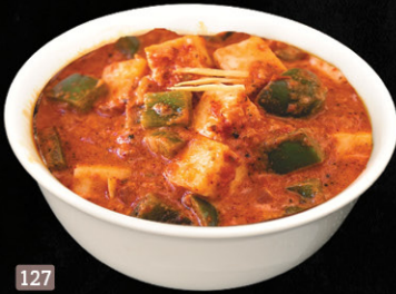
127 كداي بانير PANEER KADAI DHS. 15.00