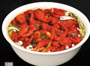
105 دجاج دراغون DRAGON CHICKEN