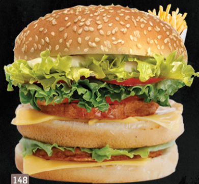
148 برجر دبل DOUBLE BURGER