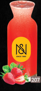
فراولة STRAWBERRY DHS. 7/10/13