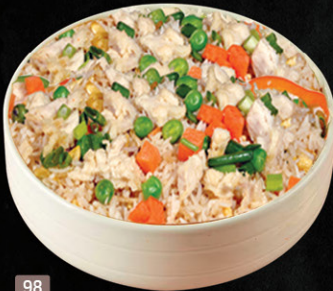
98 ارز مقلي بيض/ دجاج EGG/CHI FRIED RICE DHS. 12/14