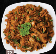
72 كوتو براتا KOTHU PORATTA DHS. 14.00