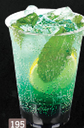
195 موهيتو ليمون نعناع LEMON MINT MOJITO DHS. 15.00