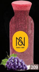
عنب أسود BLACK GRAPE DHS. 8/10/13