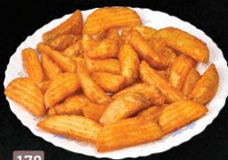
178 بطاطا ودجيس POTATO WEDGES DHS. 8/12