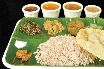
77 موتا/ باریک سیت MOTA/ BARIK SET DHS. 9.00