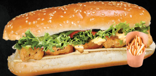
163 كومبو تكا TIKKA COMBO