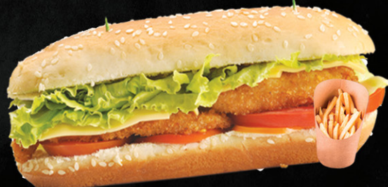
161 كومبو فيليه دجاج CHICKEN FILLET COMBO