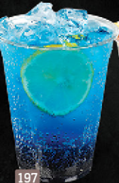
197 موهيتو توت اترنج BLUEBERRY MOJITO DHS. 15.00