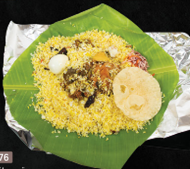
76 پوتی برياني POTHI BIRIYANI DHS. 14.00