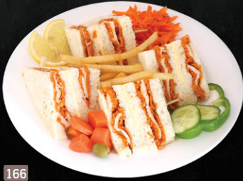
166 كلوب زنجير ZINGER CLUB