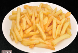
177 بطاطا مقليّة FRENCH FRIES DHS. 6/12