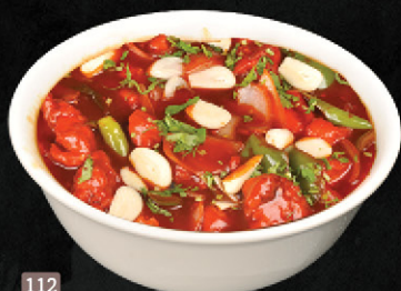
112 دجاج بالثوم GARLIC CHICKEN