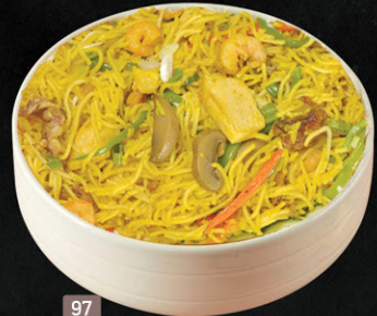
97 معكرونة هاكا HAKKA NOODLES DHS. 14/16