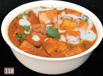
118 بانير بالزبدة مسالا PANEER BUTTER MASALA DHS. 15.00