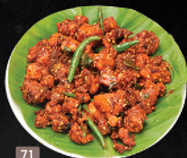
71 دجاج كونداتام CHICKEN KONDATTAM DHS. 16.00