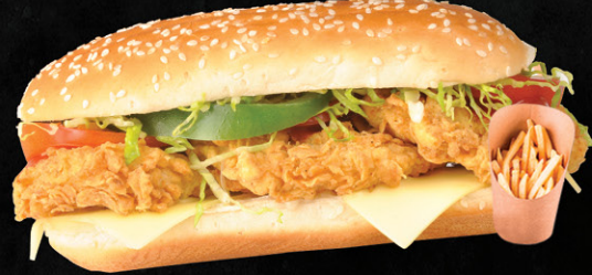
159 كومبو زنجير خاص ZINGER SPECIAL COMBO