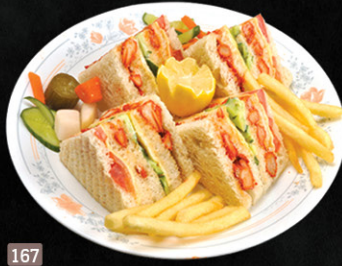
167 كلوب خاص SPECIAL CLUB