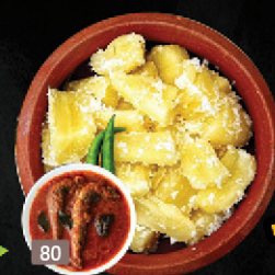
80 صالوة سمک کابا KAPPA FISH CURRY DHS. 12.00