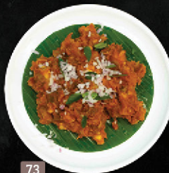
73 كابا برياني KAPPA BIRIYANI DHS. 14.00