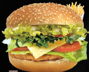
152 برجر خضار VEGETABLE BURGER