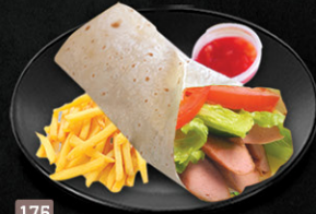
175 راب نقانق HOTDOG WRAP