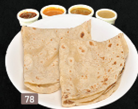
78 شباتی سیت CHAPATI SET DHS. 9.00