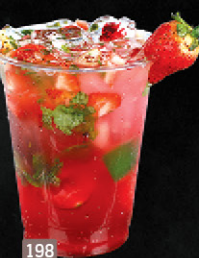
198 موهيتو فراولة STRAWBERRY MOJITO DHS. 15.00