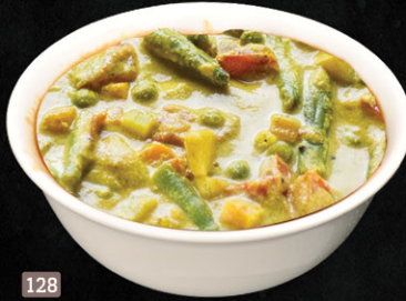
128 كورما خضار VEG. KORMA DHS. 8.00