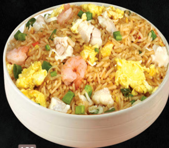
102 ارز مقلي مشكل MIXED FRIED RICE DHS. 18.00