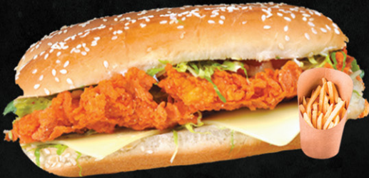
160 كومبو زنجير حار ZINGER HOT COMBO