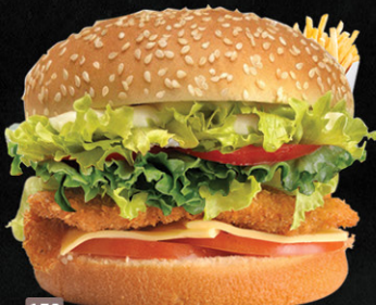
150 برجر فيليه سمك FISH FILLET BURGER