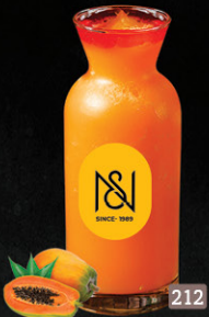
بابايا PAPAYA DHS. 7/10/13