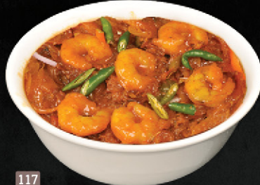
117 روبيان روست PRAWNS ROAST