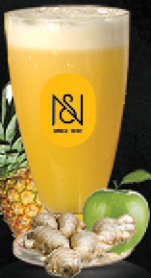
192 JUICE SALVATION APPLE, GINGER, PINEAPPLE,