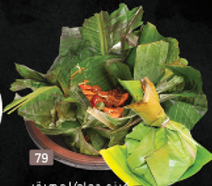
79 کیزی دجاج/لحم بقر KIZHI CHI./BEEF DHS. 13.00