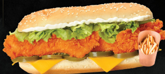
165 كومبو زنجير مطافي ZINGER MATHAFI COMBO