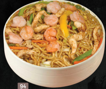
94 معكرونة مشكل MIXED NOODLES DHS. 18.00