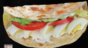
189 براتا بيض EGG PORATTA DHS. 4.00