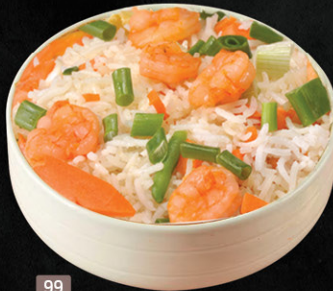
99 ارز مقلي روبيان PRAWNS FRIED RICE DHS. 18.00