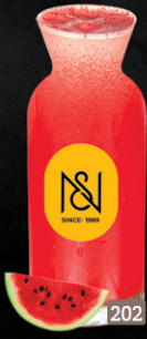
بطيخ WATERMELON DHS. 7/9/12