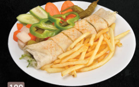
180 تندوري عربي TANDOORI ARABIC DHS. 13.00