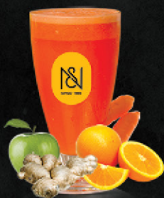
190 POWER BOOSTER CARROT, APPLE, ORANGE, GINGER

JUICE IS A LIQUID (SQUEEZE) THAT IS NATURALLY CONTAINED IN FRUIT AND VEGETABLES. IT CAN ALSO REFER TO...JUICE MAY BE PREPARED IN THE HOME FROM FRESH FRUIT AND VEGETABLES USING A VARIETY OF HAND OR ELECTRIC TOOLS.