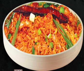
103 ارز مقلي سيشوان دجاج SCHEZWAN CHI. FRIED RICE DHS. 16.00