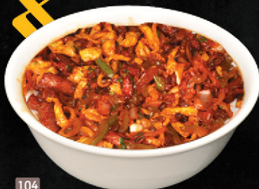
104 دجاج ماجستك CHICKEN MAJESTIC

CHINESE CUISINE IS ONE OF THE WORLD'S OLDEST AND MOST DIVERSE CUISINES, COMPRISING FOODS ORIGINATING FROM CHINA. CHINESE MEALS INCLUDE FOUR MAIN FOOD GROUPS - FRUITS, VEGETABLES, GRAINS AND MEAT. THESE DISHES DON'T CONTAIN LARGE AMOUNTS OF FAT.