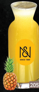
أناناس PINEAPPLE DHS. 7/10/13