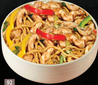
92 معكرونة خضار/ بيض/ دجاج VEG./EGG/CHI. NOODLES DHS. 12/14