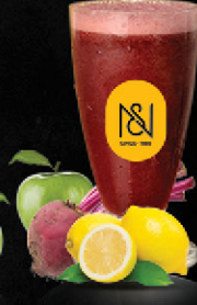
194 LIVER CURE BEETROOT, APPLE, LEMON,