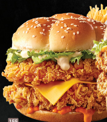
155 برجر لاسطي LUSTY BURGER