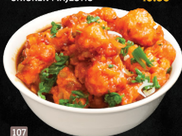
107 جوبي منشوريان GOBI MANCHURIAN