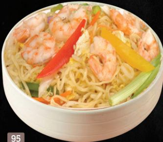
95 معكرونة روبيان PRAWNS NOODLES DHS. 18.00